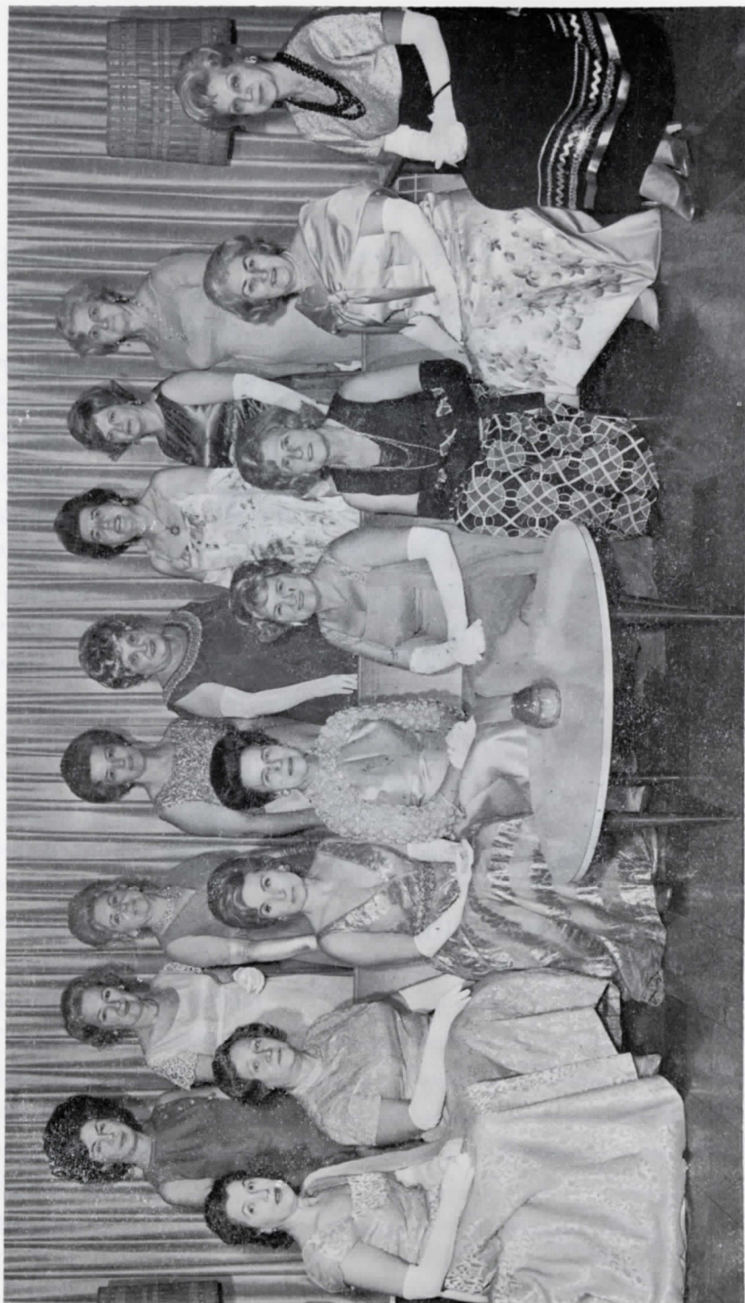
1972 WHITE AND RED BALL COMMITTEE